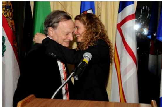
Canadian astronaut Julie Payette helps Herzberg winner John Polanyi with his medal.