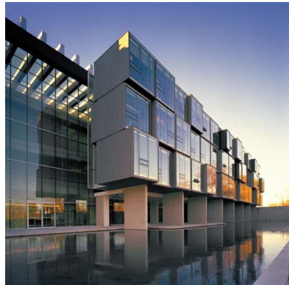
Waterloo's Perimeter Institute unveiled its Mystery of Dark Matter video in Boston.

Several NSERC-funded researchers were in attendance during the five-day conference that began February 14, and media interest in their work was significant. Five NSERC-funded researchers were also inducted as AAAS Fellows.