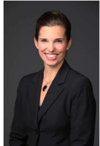
The Honourable Kirsty Duncan Minister of Science and Sport

Together with Canadians of all backgrounds, regions and generations, we are proud to be building a strong, equitable, diverse and inclusive science culture that will position Canada as a global leader in natural sciences and engineering research and innovation.